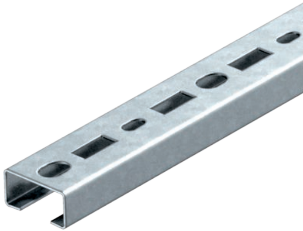
Light-duty profile rail, perforated, slot width 17 mm.