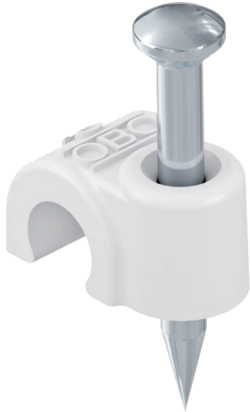
ISO nail clip, short design