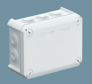
With plug-in seal