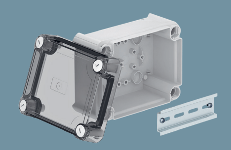
Closed with elevated transparent