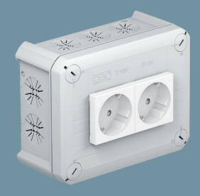
With Modul 45 sockets