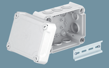
With entry openings and elevated cover