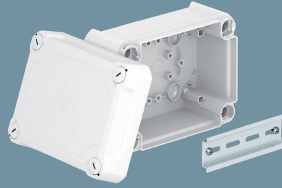
Closed with elevated cover