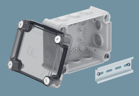
With insertion openings and elevated transparent cover